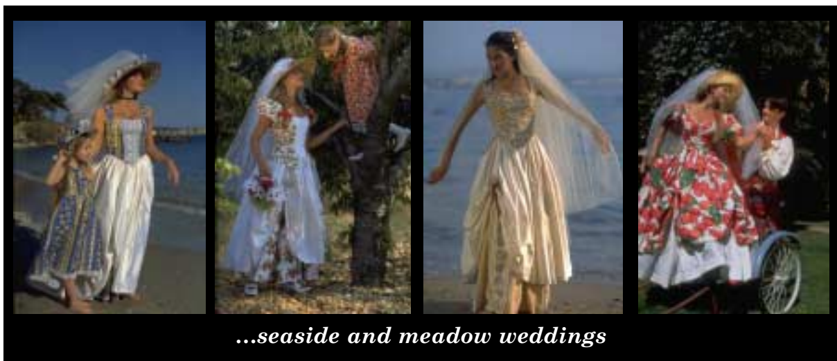
...seaside and meadow weddings