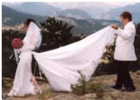
...in the highlands

We direct and prepare anything, from a Hi-Tech to a very Romantic style wedding, anyplace you choose from a hotel ballroom to a paradise beach of one of the Aegean Islands.